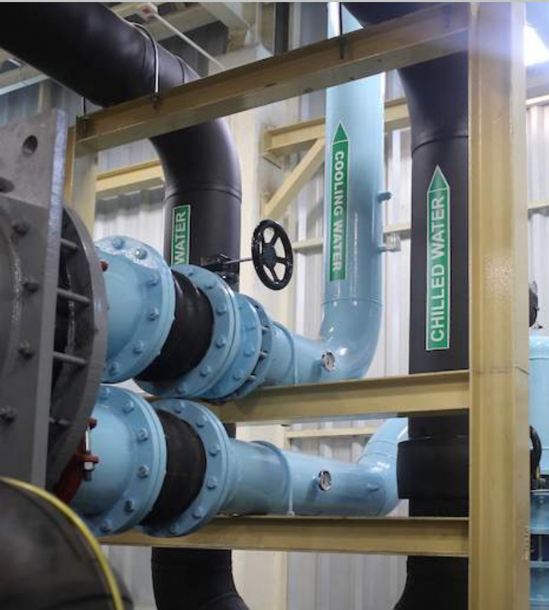
Absorption Chillers piping

A cogeneration system produces electricity and thermal energy simultaneously.