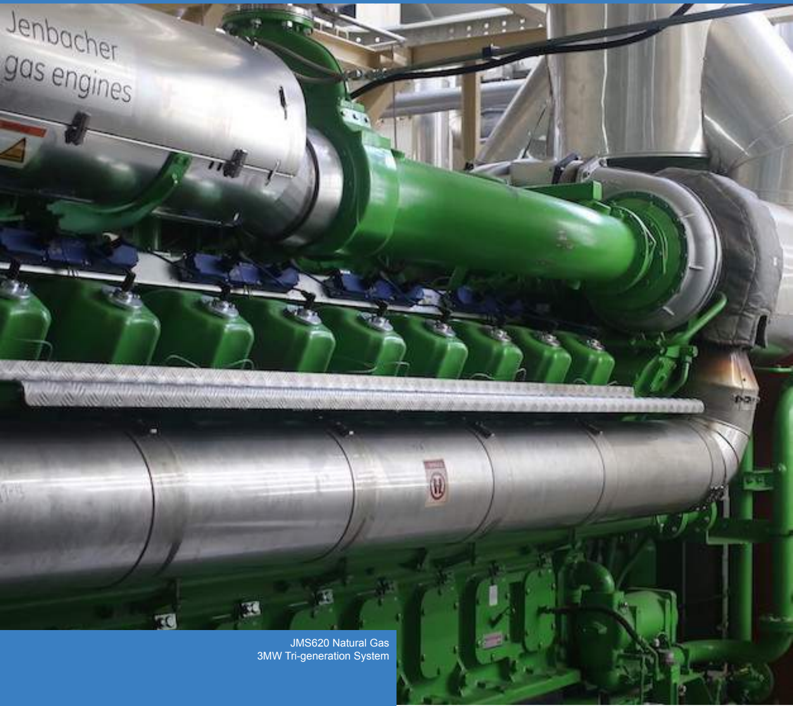
JMS620 Natural Gas 3MW Tri-generation System

The company is also Core Distributor & Service for LG Electronics Inc. in Thailand and can provide a full range of chiller and HVAC solutions.